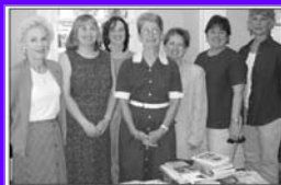
Thanks again to members of the Mid-South Chapter of the Special Libraries Association who have donated proceeds from their organization to purchase new books for Hope House. For two years now. Not only are they books for children, but also journals and books for parents to read and take home as well.

An ad hoc committee was established to look into a charitable activity for our chapter for the year 2000.