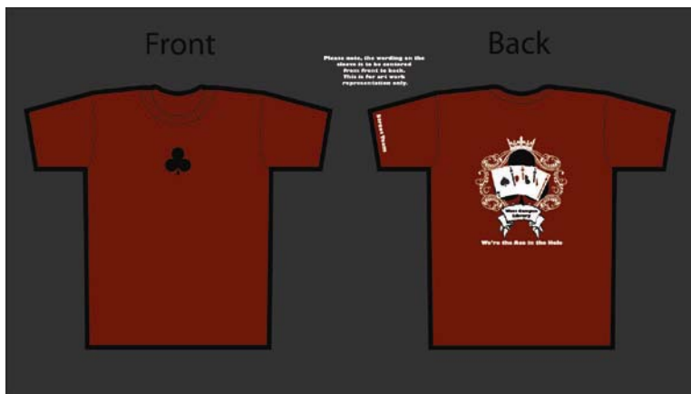
Figure 2 Street Team t-shirt design

One important organizational step that was accomplished was the creation of a Street Team identity, in the form of a distinctive t-shirt. With the assistance of the Libraries' graphic designer, the team developed a concept for the team's logo and the t-shirt design. The team's "Ace in the Hole" graphic (see Figure 2) combines the idea of winning cards and good grades (Aces and A's) with WCBL's resources and services. This was a truly inspired idea that shows the group's creativity.